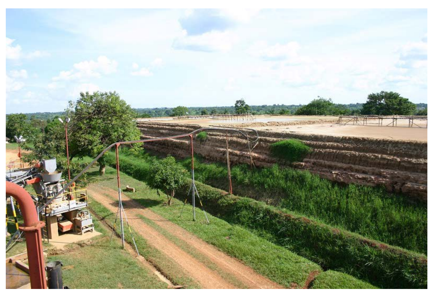
Urbanisation have meant that less land is available for TSFs, so these tailings dams had to cover a smaller footprint.

Since the 1990s, higher levels of urbanisation have meant that less land is available for TSFs, so these tailings dams had to cover a smaller footprint and, therefore, be higher than previously. Cyclone deposition was employed as a strategy to allow for these designs.