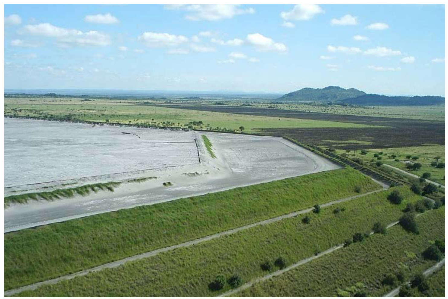
Continuous efforts are taking place to find ways of making tailings storage facilities safer.

Probably not appreciated in these early years were the implications of these dams growing; they would commonly double in size every 10 years as the process plant capacities increased. One of the results was that many failures occurred, even in the late 1800s, leading to the formation of Fraser Alexander in the early 1900s as a tailings dam construction specialist.